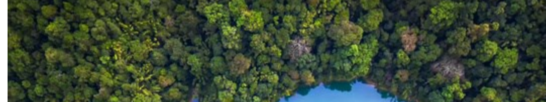
Surat Thani Canal Surat Thani, Thailand